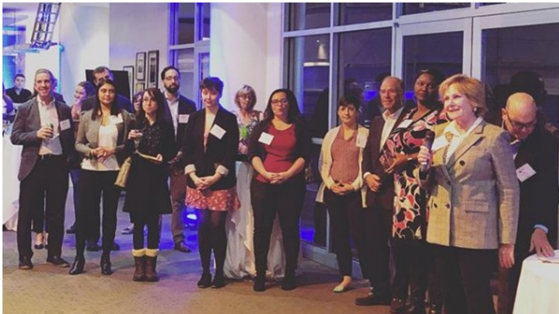
The staff and Board of Directors of The Energy Co-op celebrating our 40th Anniversary.

Join us for lunch or dinner to talk about energy, cooperatives, and how The Energy Co-op can better serve you!